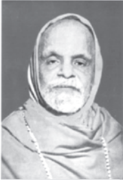
Bharati Krishna Tirthaji

The revival of Vedic Mathematics is no less than a miracle. Extracting the theorems and corollaries from religious texts requires not only an understanding of the scriptures but also a genuinely intelligent mind.